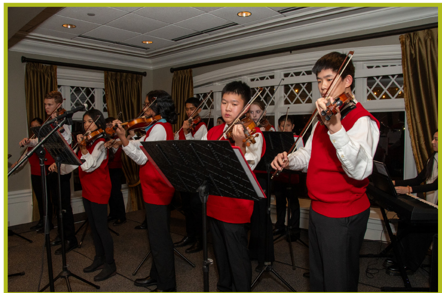
Members of The Allegro!!! Ensemble perform for Trinity guests at An Evening of Holiday Music held at the Butterfield Country Club in Oak Brook.

Supporting people with disabilities and mental health needs since 1950.