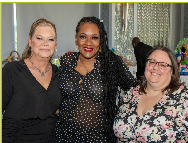
Better Together Dinner Dance Saturday, September 21, 2024