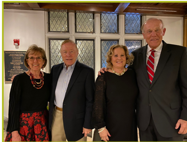
An Evening of Holiday Music Friday, December 6, 2024