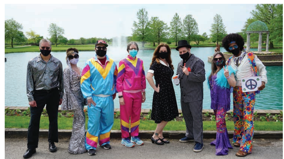
Golfers from KODO Care Pharmacy and Trinity Services staff members dress for the "Through the Decade" theme.