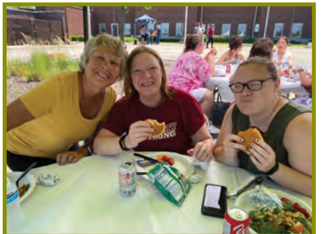
Trinity Services' residents and staff enjoy themselves at the first annual Juneteenth celebration and barbeque!