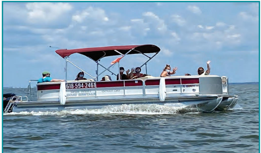
People supported and staff enjoy a fun excursion across Lake Carlyle in June.