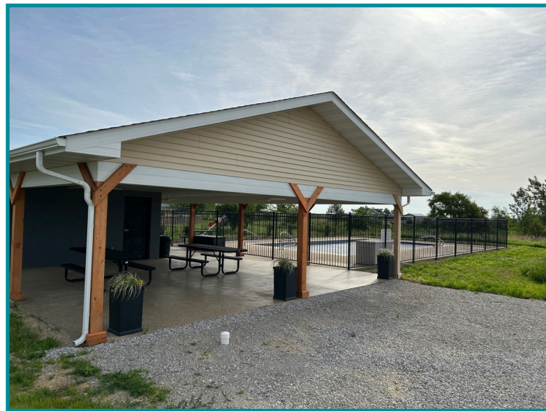
On May 18, 2024, Trinity Services and Abundant Living for All (ALFA) Foundation dedicated the new pool house with a ribbon cutting ceremony.