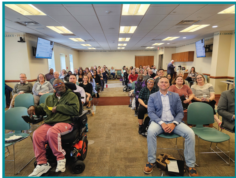
Trinity employees, community leaders, friends, and people supported attend Stakeholder's Day during CQL accreditation week.