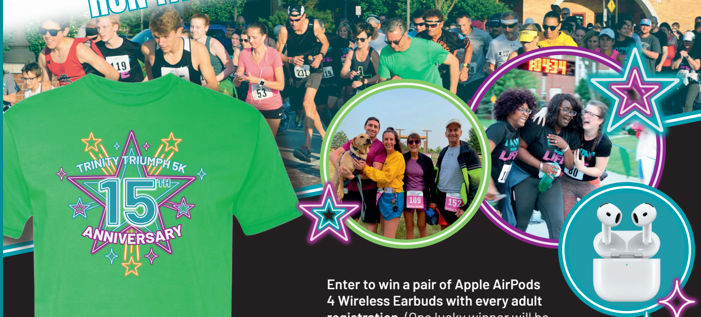
2025 Race Performance Tee

Enter to win a pair of Apple AirPods 4 Wireless Earbuds with every adult registration. (One lucky winner will be announced during the awards ceremony after the race.)