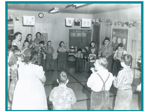
Photographs of children with developmental disabilities attending the Trinity School in the 1950s and 1960s.