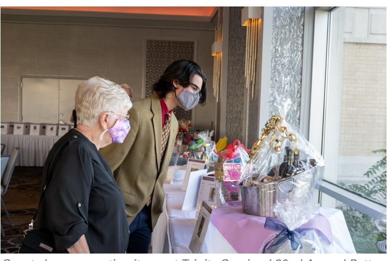
bers during Guests browse auction items at Trinity Services' 32nd Annual Better some of the Together Dinner Dance & Auction, held Sept. 18 at The Odyssey.

Trinity is grateful to all who made this event a success for those we support.