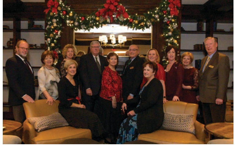
The Dinner & Concert Gala Committee gathers for a photo Dec. 6 at the Butterfield Country Club in Oak Brook.