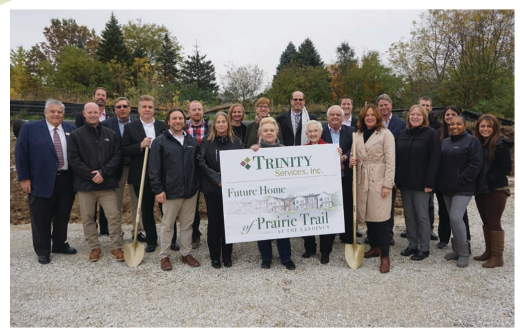
Trinity Park Vista is a 16-unit permanent supportive housing development in which Trinity Services staff members provide support to up to 19 people in Northlake, Illinois.