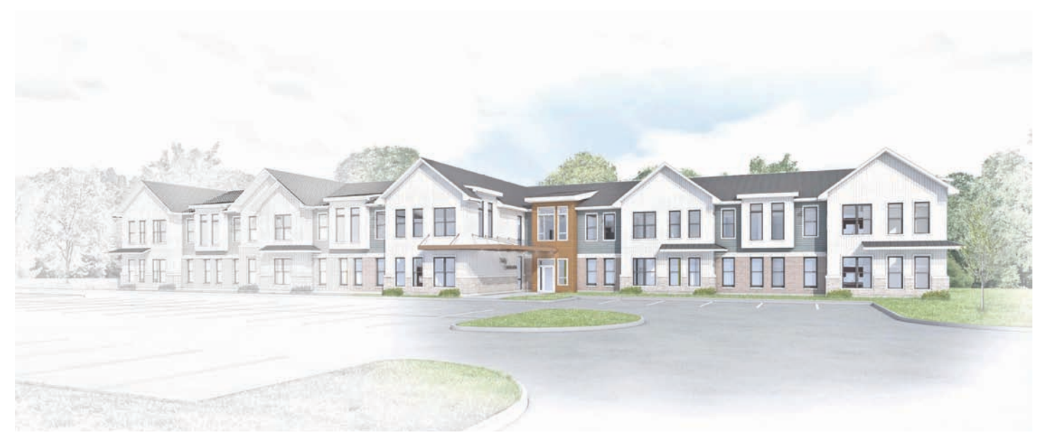
A rendering of Prairie Trail at The Landings, created by Worn Jerabek Wiltse Architects, P.C.

Prairie Trail will give residents a place to call their own, building their confidence and providing them the support they need to flourish and live full and abundant lives.