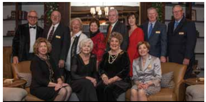
Members of the Concert Gala Committee gather for a photo.