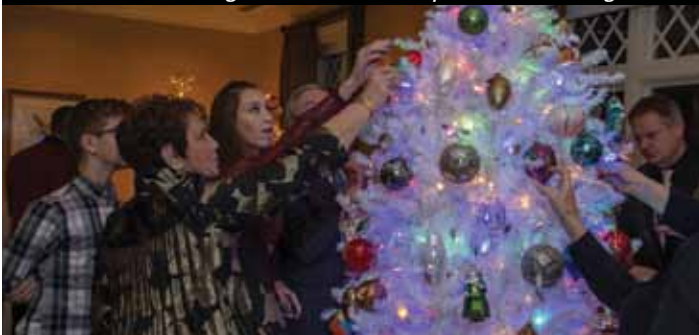
Guests browse ornaments for sale at the event's Giving Tree.