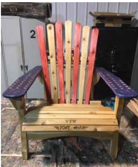
The completed patriotic chair from New Lenox Woodworks, for VFW Post 9545.

For more information about New Lenox Woodworks, to see more of its products, and to place orders, follow the program at Facebook.com/NL-Woodworks or call (815) 463-4692. Customers may also call to coordinate an in-person visit to the program, which is located in New Lenox.