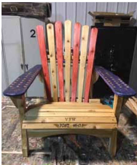
The completed patriotic chair from New Lenox Woodworks, for VFW Post 9545.

"We decided we wanted to donate a chair to the VFW for Veterans Day,