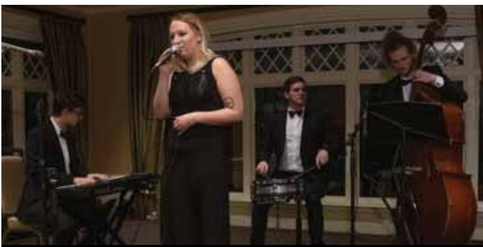
The Elmhurst College Jazz Ensemble performs during dinner.