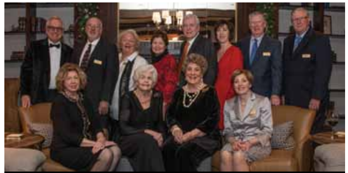
Members of the Concert Gala Committee gather for a photo.