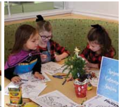
Children color pictures during the event.