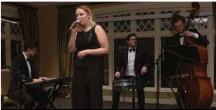
The Elmhurst College Jazz Ensemble performs during dinner.