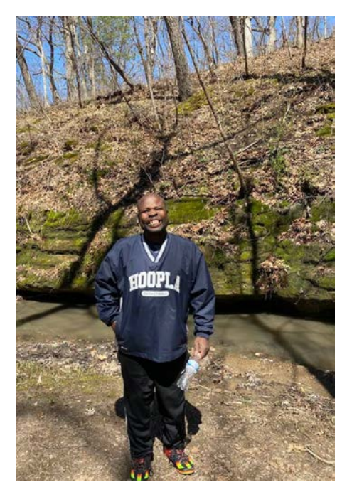
Enjoying a hike

s the weather gradually gets warmer and local coronavirus risk levels decrease, people who receive support from Trinity Services are enjoying experiences around their communities and local trips, highlighted in these photos.