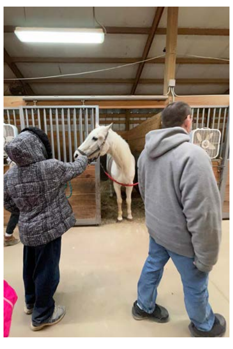
Greeting the horses at STRIDES, Trinity's therapeutic horseback riding program