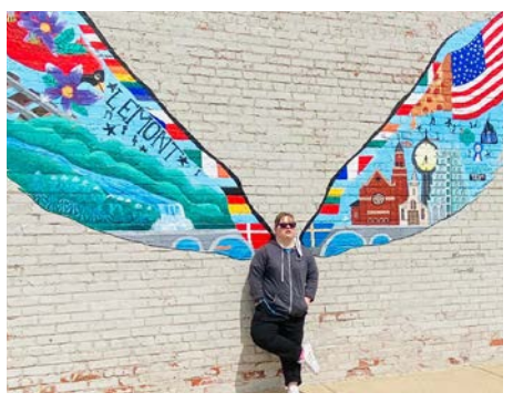
Walking around downtown Lemont