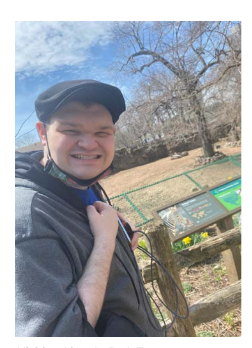
Visiting Lincoln Park Zoo