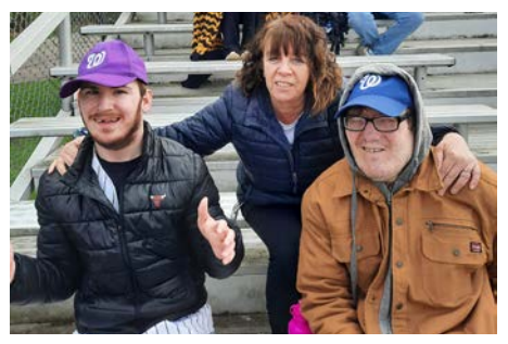
Cheering on the Wilmington High School baseball team