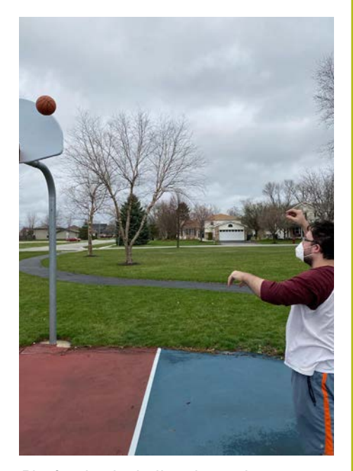
Playing basketball at the park