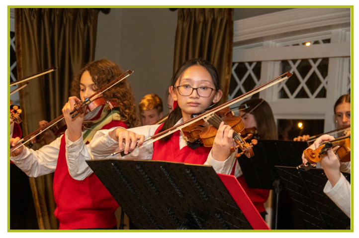
Holiday Dinner and Concert Gala Friday, December 1, 2023