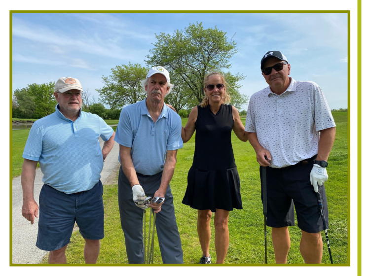
Tom O'Reilly Memorial Golf Classic Thursday, May 18, 2023