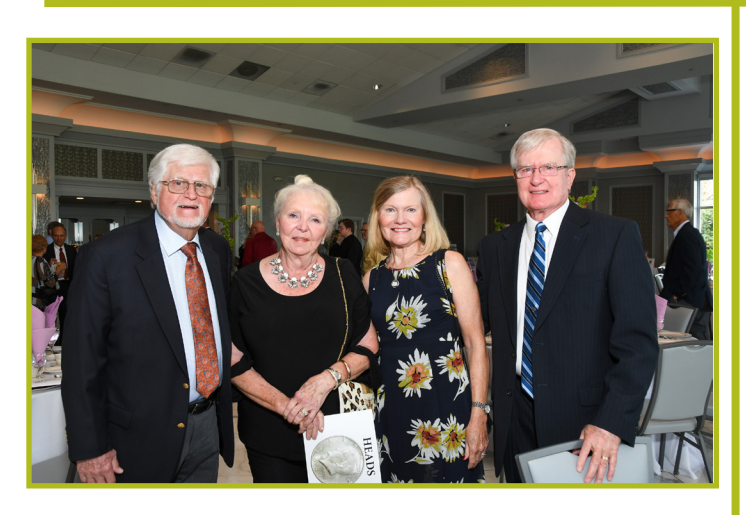
Better Together Dinner Dance Saturday, September 23, 2023